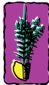
The Four Species

MINHAH & ARVIT FOR SHABBAT HOL HAMOED ..... 5:30 PM LIGHT SHABBAT CANDLES ( no later than ) ..... 5:52 PM